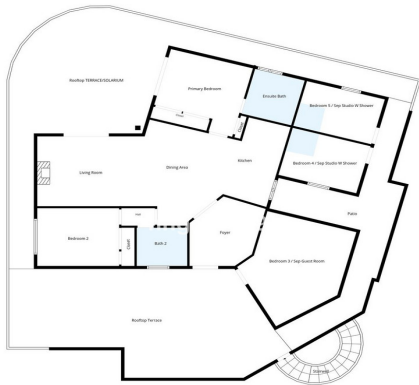
Floor Plan Created By Cubicasa App. Measurements Deemed Highly Reliable But Not Guaranteed.