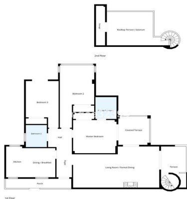
Floor Plan Created By Cubicasa App. Measurements Deemed Highly Reliable But Not Guaranteed.