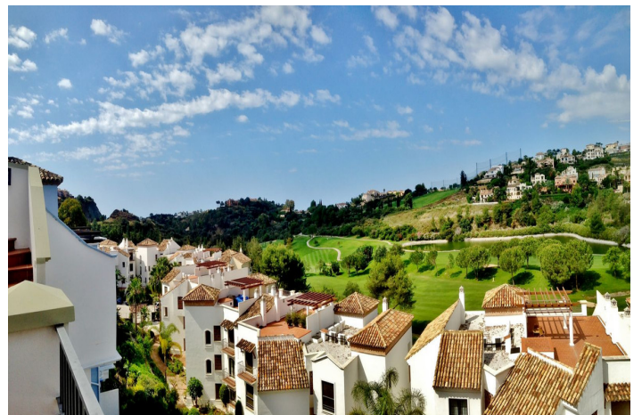
90 sq. mtrs. of rooftop solarium